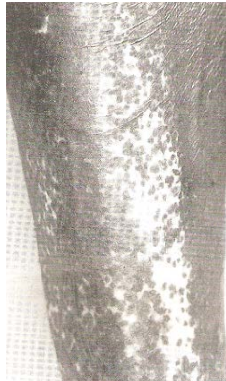
Figure 3. Picture of patient with leopard skin (shin depigmentation) observed during the study

Figure 3 below shows the picture of a patient with leopard skin observed during the study. The leg is scaly and very itchy.