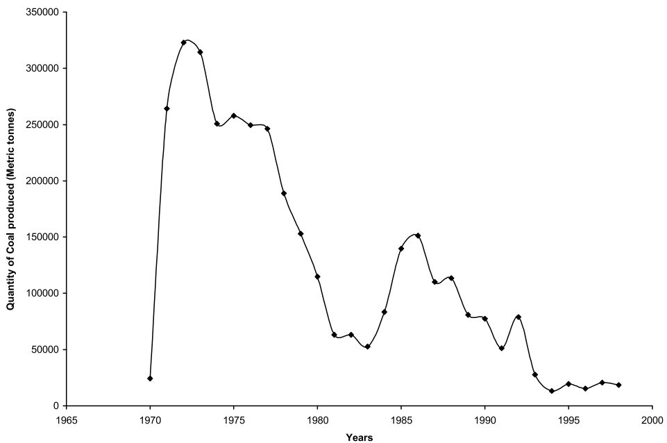
Figure 2. Graph showing the trend of coal production from 1970–1971 through 1998.