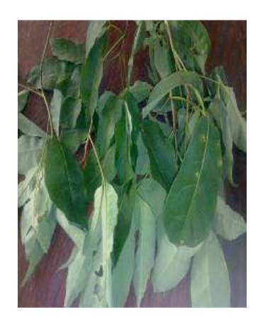
Fig. 1. Photographs of Crateva adansonii obtained from Orlu, Imo State, Nigeria